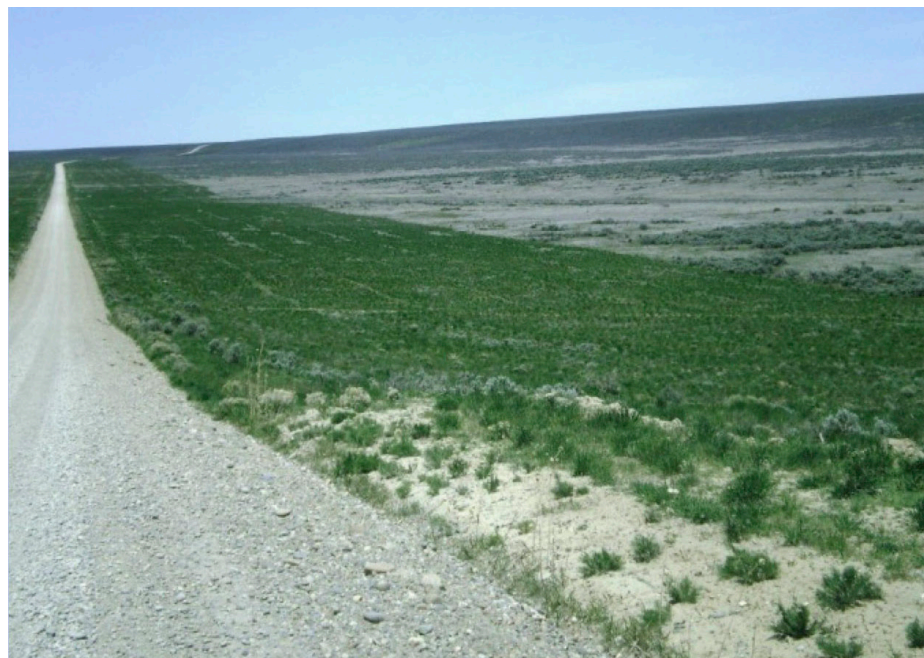
Figure 3. A greenstrip in south-central Idaho grazed by livestock in early spring resulting in reduced cheatgrass and a longer effective period to reduce potential wildfire impacts.

Greenstrips: Greenstripping is the concept of strategically establishing fire-resistant vegetation to reduce the rate of spread and the intensity of wildfires. Greenstripping is a preferred method in areas that have undergone conversion to invasive annual grassland or areas highly susceptible to annual grass invasion. Strips 100 to 300 feet wide are recommended. The primary advantage of greenstripping is that once they are established they are long term fuel breaks that require limited maintenance. Another advantage is that properly timed livestock use can reduce cheatgrass thereby decreasing fuel continuity and lowering competition with seeded species, which can lengthen the period that the greenstrip plants remain green (Figure 3). Species selected for greenstripping should be fire and drought tolerant, palatable, and able to compete with annual species (Pellant 1994). Species selection for greenstripping is contingent on local conditions and management objectives. Introduced or native species can be effective depending on site conditions (Monsen 1994). Some introduced species have the potential to escape into native