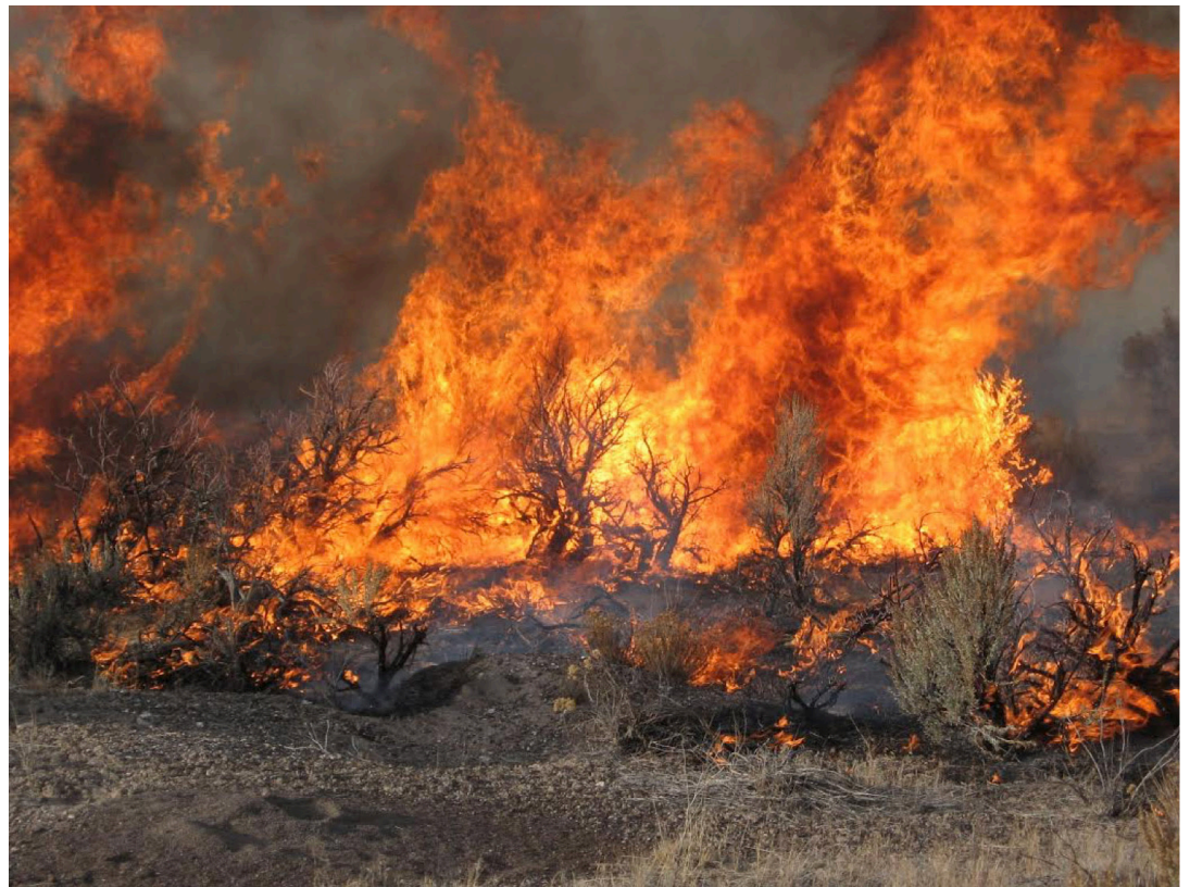
Figure 2. Example of fire behavior in a Wyoming big sagebrush vegetation type (SH5 fuel model).

Back fire: Intentionally setting fire inside the control line to slow or contain a rapidly spreading fire. Provides a wide defense perimeter and makes possible locating control lines where the fire can be fought on the firefighter’s terms.