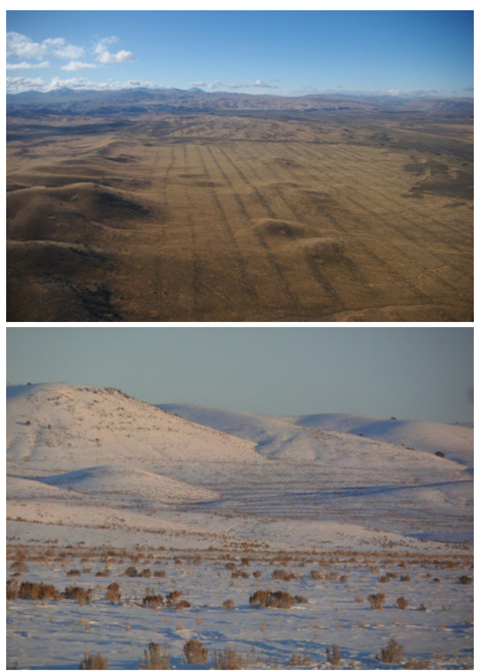
(Top) Fixed wing aerial ESR sagebrush seeding on the 2006 Susie Fire north of Carlin, NV. Seeding was done every third swath in crucial big game winter range and sage grouse habitat. Photo looking south toward Carlin taken October, 2011. (Below) 2006 Susie Fire aerial sagebrush seeding seven years after treatment. Area was seeded in stripes with a fixed wing aircraft.

Sagebrush is also subject to the negative effects of competition from seeded grasses, especially from more competitive introduced forage grasses or when any perennial grasses are seeded at high rates. It is sometimes possible to successfully establish big sagebrush in seedings that include introduced perennial forage grasses, but a reasonable balance must be maintained. Adding a token amount of sagebrush seed that fails to establish does not demonstrate that mixed seedings always fail. Reducing the seeding rates for perennial grasses