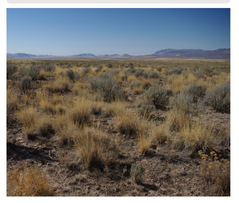
2005 Esmeralda Fire, Emergency Stabilization and Rehabilitation (ESR) sagebrush and yarrow seeding on Willow Creek Ridge, 14 miles east of Midas, Nevada. Photo taken October, 2014.