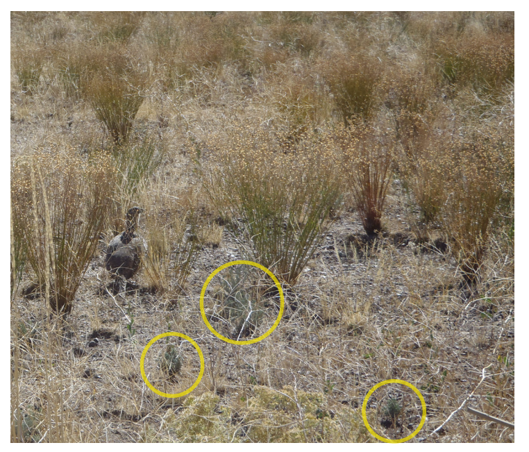
Sage grouse in the 2011 Indian Creek Fire native grass/ forb drill seeding project area, which was overseeded with Wyoming big sagebrush. Photo taken September 2013, two growing seasons after the treatments were completed. Establishing juvenile sagebrush plants (circled) can be found throughout the stand.

Key components of maintaining high viability are controlling seed moisture content and storage at cold temperatures. The take-home for managers is to: (1) use a current-year seed lot if possible, (2) purchase seed that has been cold-stored, and (3) have a seed lot that is a year or more old retested for viability immediately prior to purchase. Use of current-year seed lots can often be practical even though seed is produced late in the season. Taking precautions to assure that the seed lot used is of high quality is essential, as poor quality seed is a common cause of seeding failure.